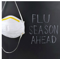
Staying Healthy This Season & A Covid 19 Vaccine Update