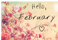
A Peek at the Month Ahead (Activities!)