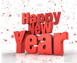
A Look at Last Month's Fun